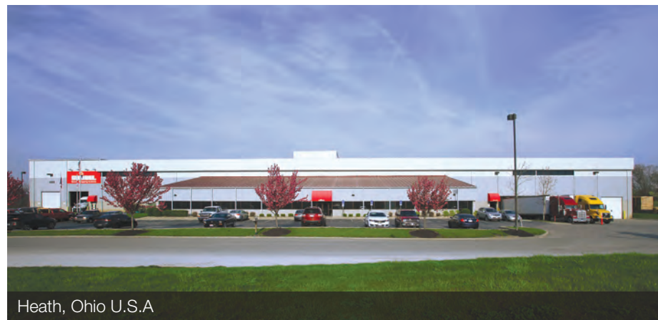
Heath, Ohio U.S.A