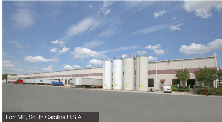
Fort Mill, South Carolina U.S.A